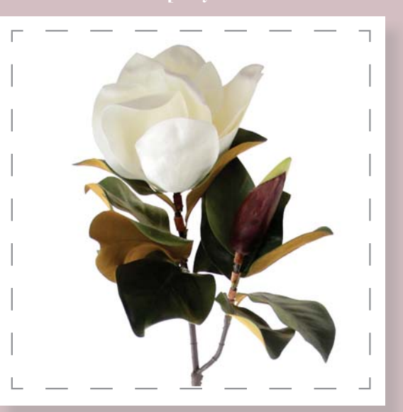
White Magnolia 1469