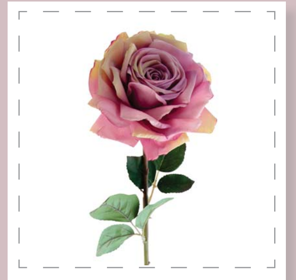
Pink Rose 1476