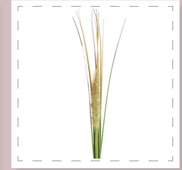
Fox Tail Spray 1479