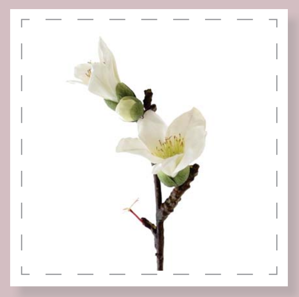
White Kapok Spray 1473