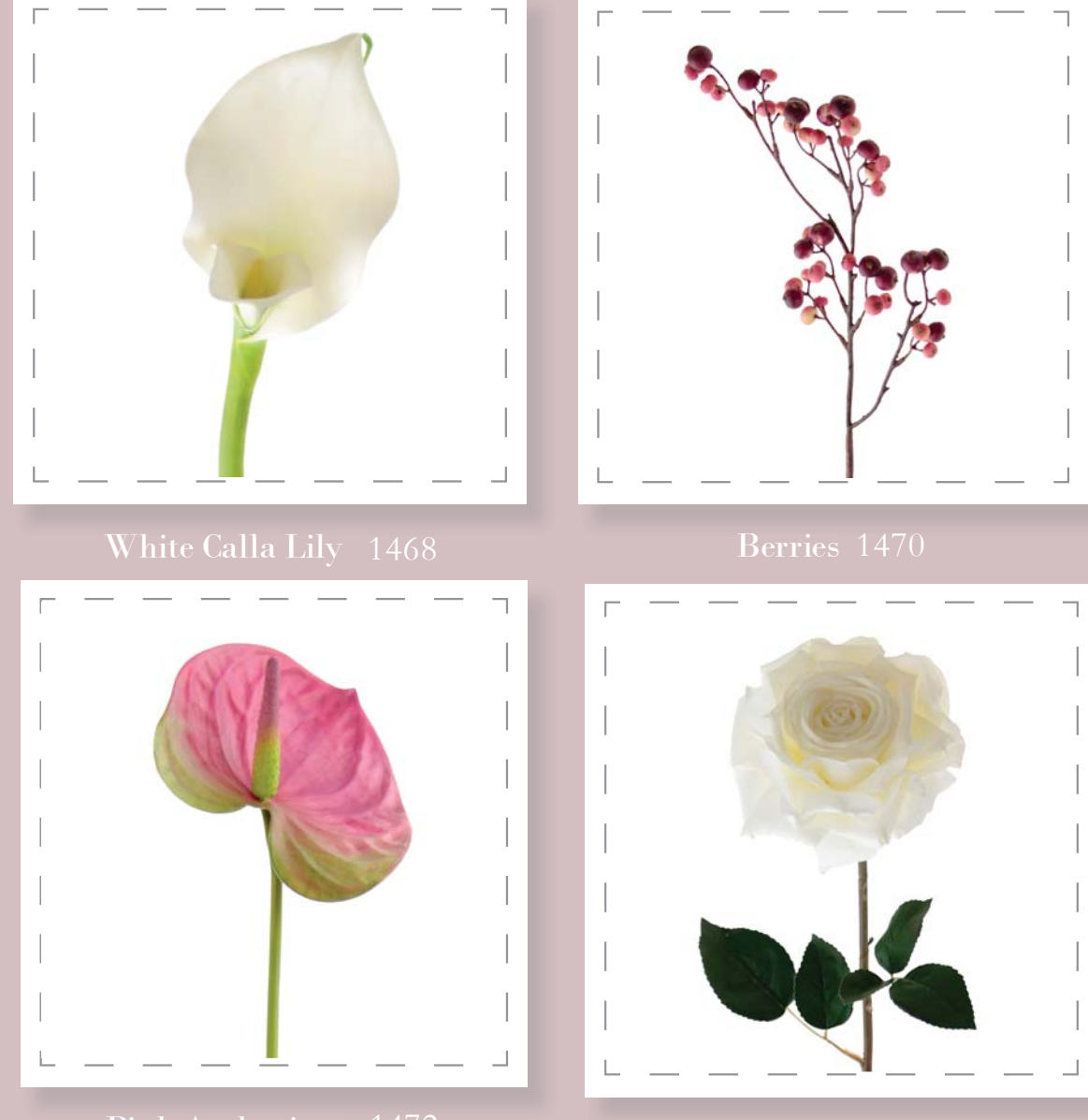
Pink Anthurium 1472