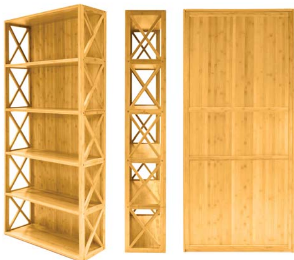
Stackable Bookcase, 5 Bookshelves