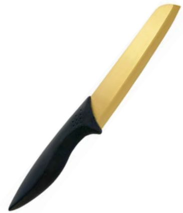
Slice Knife 6 inch 1231