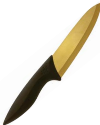
Chef Knife 7 inch 1233