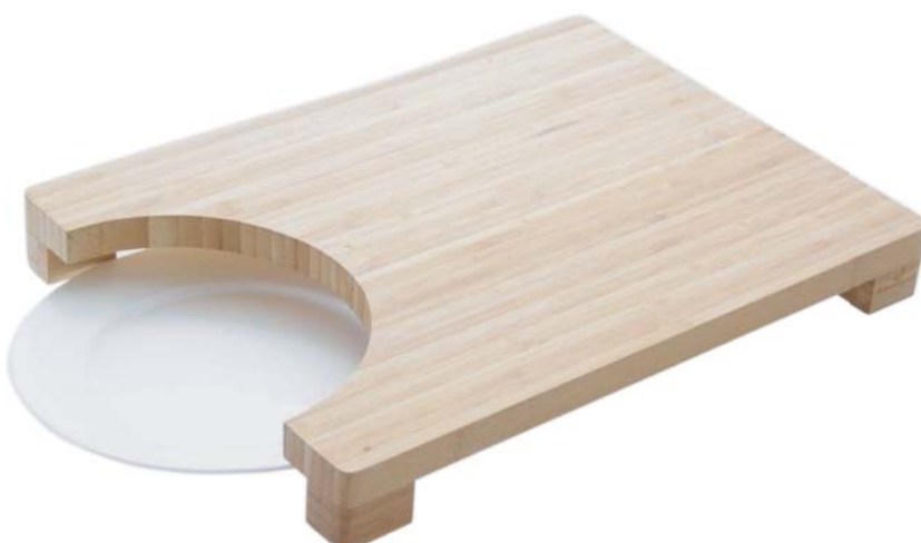
Chopping Board and Plate