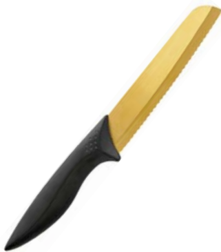
Bread Knife 6 inch 1232