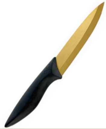
Utility Knife 5 inch 1228