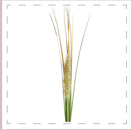
Fox Tail Spray 1479