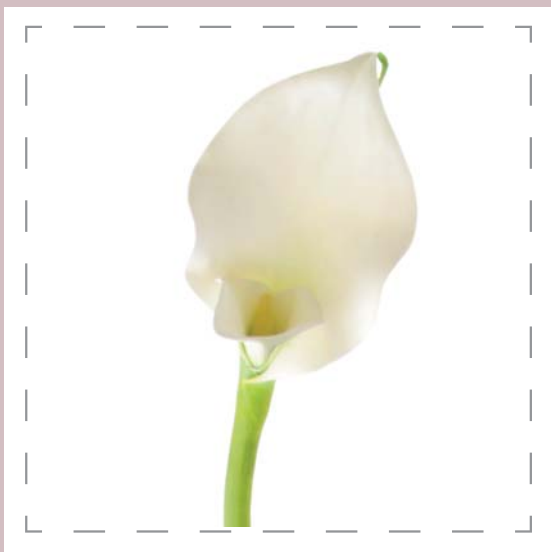
White Calla Lily 1468