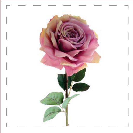
Pink Rose 1476