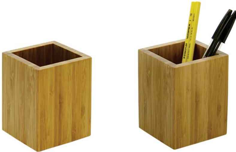
Pen Holder / Pencil Box