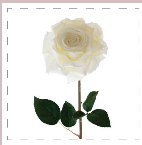
White Rose 1475