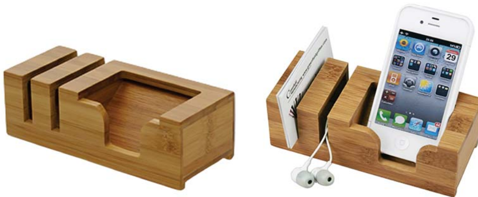
Phone Holder / iPhone Stand