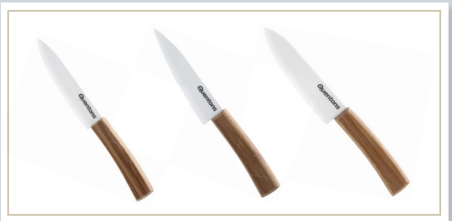
Utility 5 inch 1463