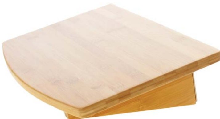
Bed Hanging Shelf