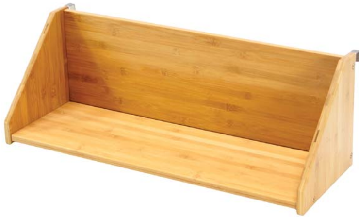
Bed Hanging Book Shelf