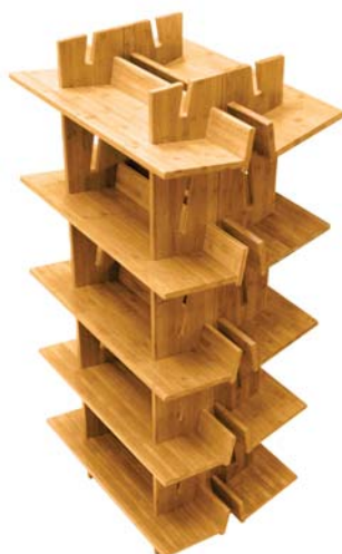
Bookcase, 5 Book Shelves