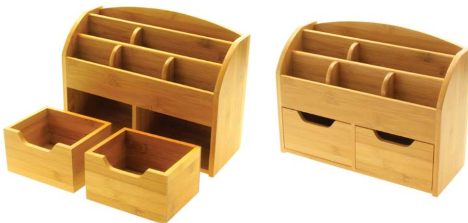
Desk Stationary Box / Wall Mounted Organiser