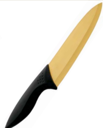
Chef Knife 8 inch 1234