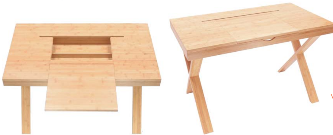
Cable-Tidy Home Office Desk