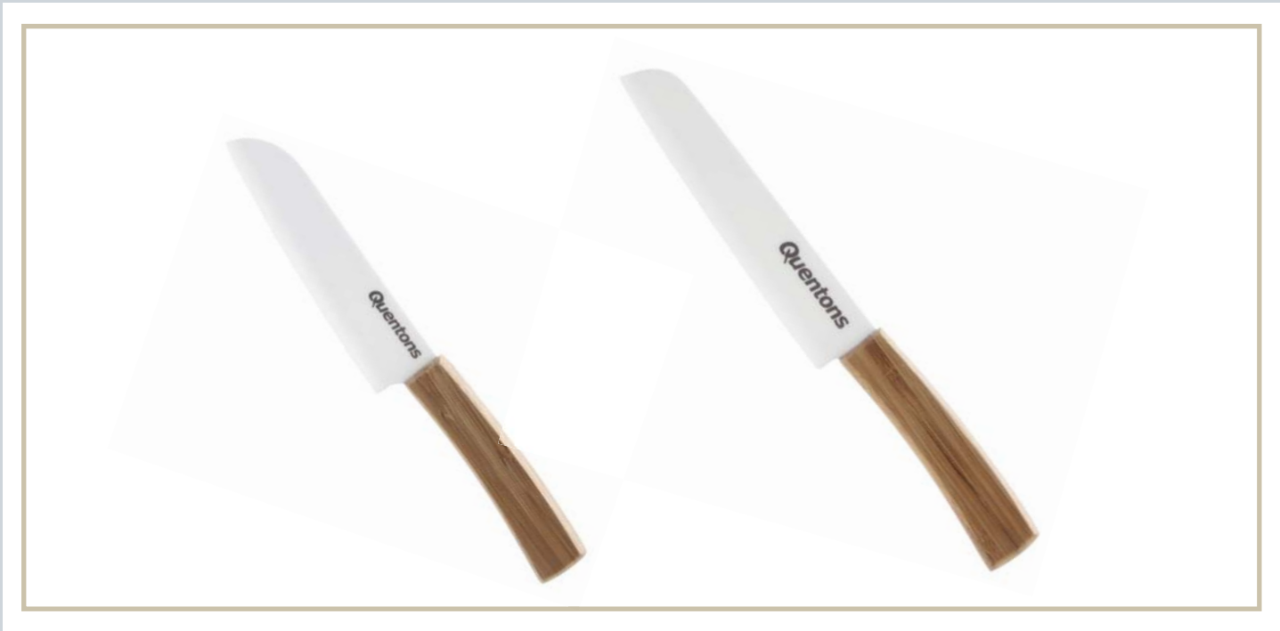
Bread 5 inch 1466