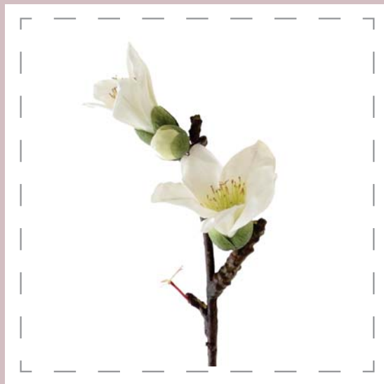
White Kapok Spray 1473