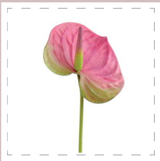
Pink Anthurium 1472