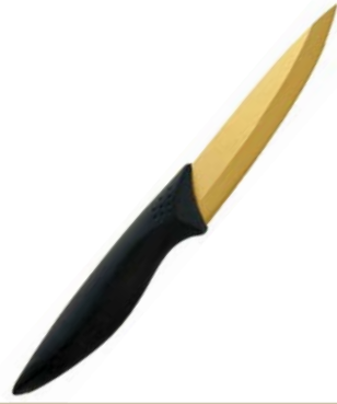
Paring Knife 4 inch 1227