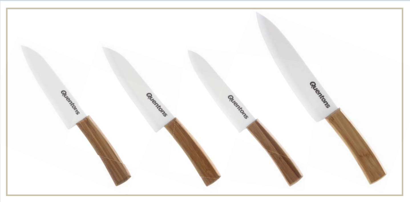
Chef 6 inch 1456