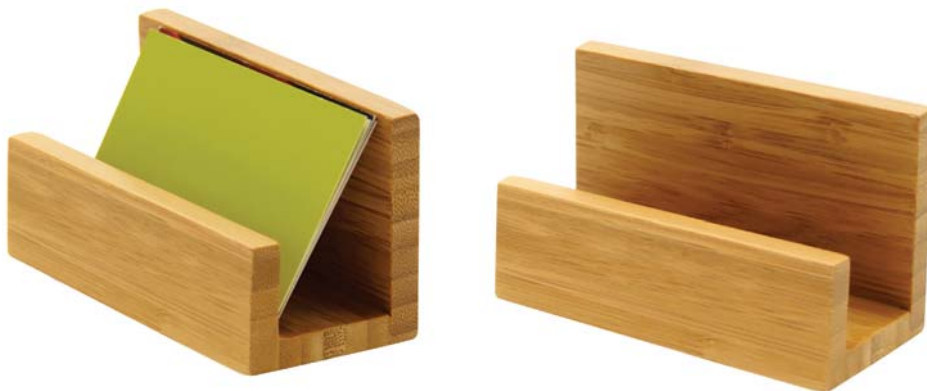
Business Card Holder