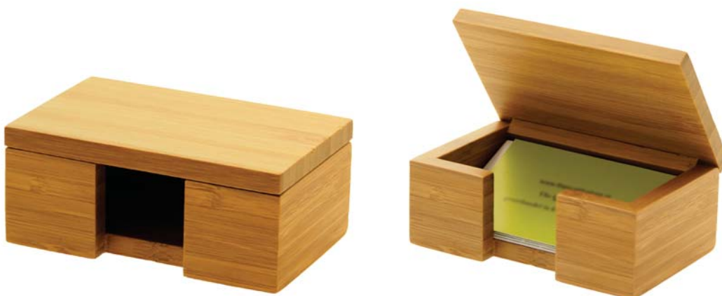
Business Card Holder Box