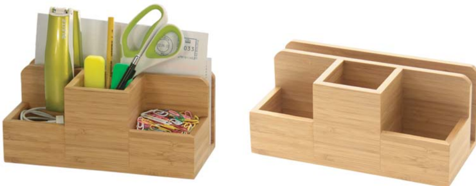
Desk Organiser / Stationary Box