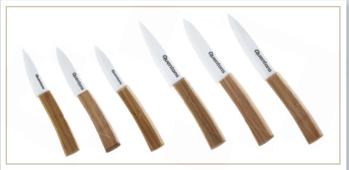
Paring 3 inch 1453