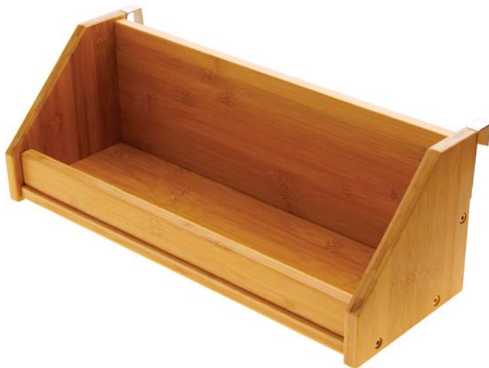
Bed Hanging Toys Shelf