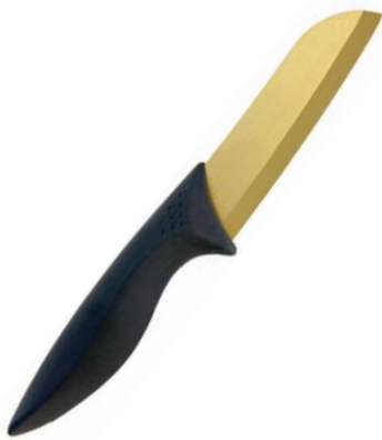
Santoku Knife 5 inch 1229