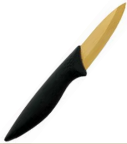
Paring Knife 3 inch 1226