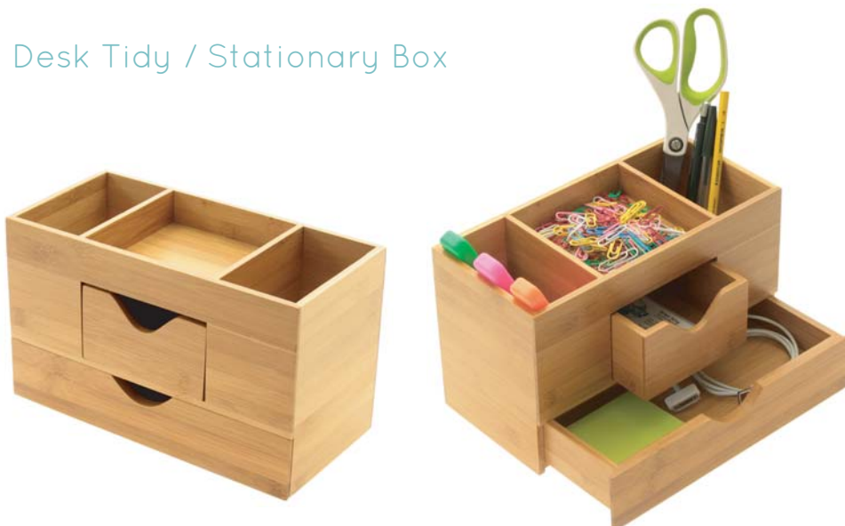
Desk Tidy / Stationary Box