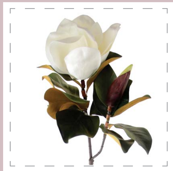
White Magnolia 1469