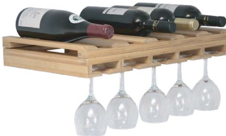
Hanging Glass Rack and Wine Bottle Holder