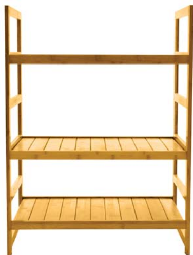
Bathroom Shelves / Shoe Rack