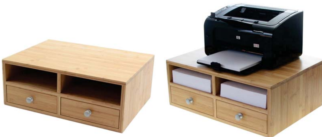
Desktop Printer Stand

SKU 1447 Including Lampshade W 300 mm D 300 mm H 445 mm