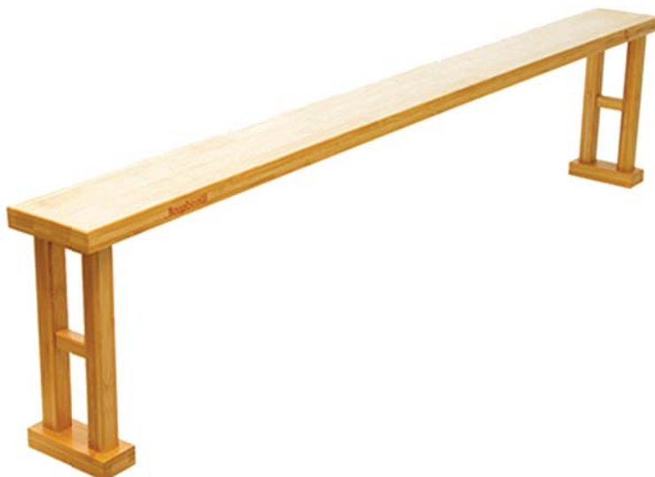
Sink Tidy Shelf